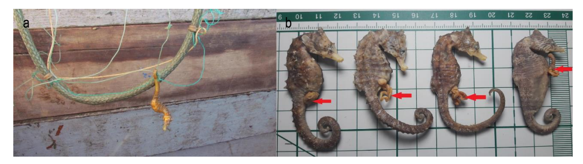
Figure 3. a) Hippocampus patagonicus alive, pulled by a gillnet in fishing along the northern coast of Rio Grande do Sul, b) Hippocampus patagonicus with the digestive tract everted by the pressure endured in the trawl net in fishing along the southern coast of Rio Grande do Sul.

the temperature factor is essential for the limited occurrence of H. reidi or H. erectus in the southern South Atlantic, as seen in this work. However, these species occur in the North Atlantic, on the east coast of the United States, at similar temperatures (Lourie et al. , 2004; Silveira et al. , 2014), suggesting that further studies on the occurrence, distribution, and ecology of seahorses are needed.